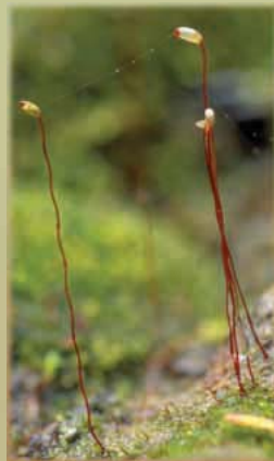
flag moss Discelium nudum