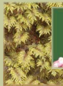
stair-step moss Hylocomium splendens

△ Lichens, such as common witch's hair, frequently obtain moisture from fog, helping it thrive near the timberline on Mt. Hood in Oregon.