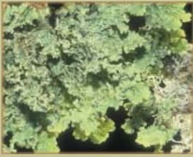
lettuce lung Lobaria oregana

◁ It has been estimated that lettuce lung provides an average of 3.2 kilograms of nitrogen each year for each hectare of Pacific Northwest forest.