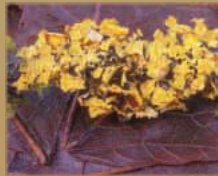
seaside kidney Nephroma laevigatum

◁ Seaside kidney fixes nitrogen. When the outer layers are eaten by animals, a bright yellow interior is revealed. ▷