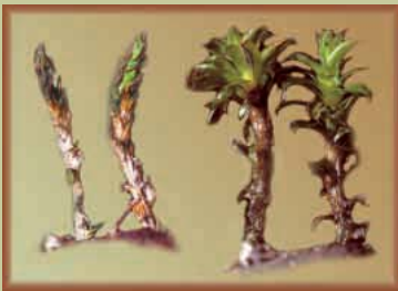
roof screw moss Tortula ruralis

▽ Seemingly lifeless lichens and bryophytes become photosynthetically active within minutes after wetting.