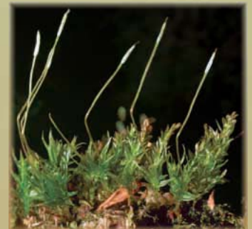
bent-kneed four-tooth Tetraphis geniculata