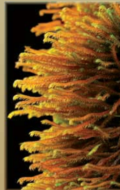
common scissorleaf Herbertus aduncus