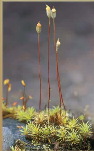
juniper haircap moss Polytrichum juniperum