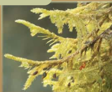
Douglas' neckera Neckera douglasii