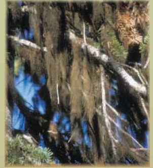
horsehair lichen Bryoria fremontii

▷ Native Americans made the poisonous horsehair lichen edible by steaming it in a pit oven for two days.