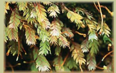
goblin gold Schistostega pinnata