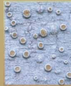
ochre disk crust Ochrolechia laevigata

△ A variety of bryophytes and lichens are able to grow on a surface (substrate) as inhospitable as rock.