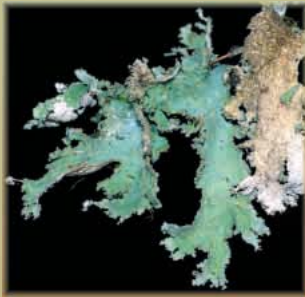
old-growth specklebelly Pseudocyphellaria rainierensis