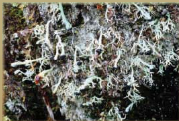
northern fan coral Bunodophoron melanocarpum