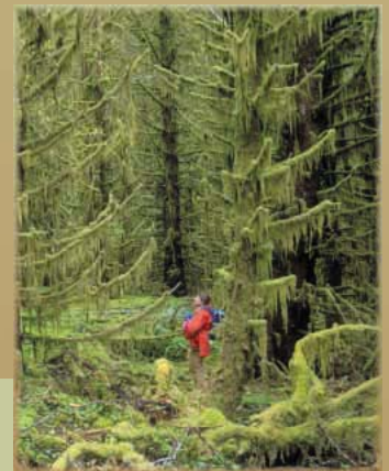
cat-tail moss Isoetecium myosuoides