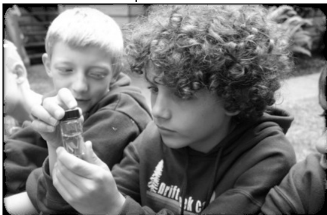
Above, a camper examines a tiny Alevin, part of a salmon life cycle display.