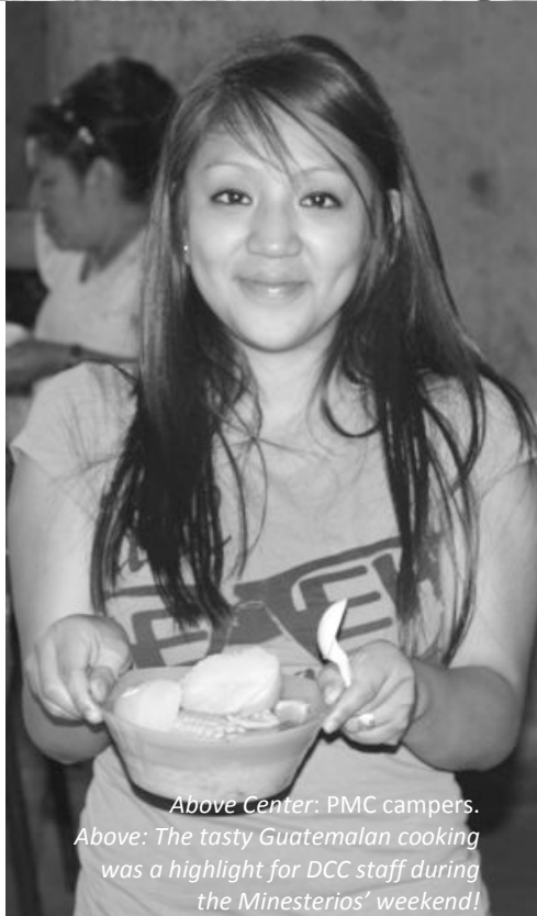
Above Center: PMC campers. Above: The tasty Guatemalan cooking was a highlight for DCC staff during the Ministerios' weekend!

Because it was the first-time for most, the whole group toured the grounds. Together they visited the amphitheater, "inspiration point" and the entire Creek-side trail! There were children so small they had to be carried and older folks who needed assistance as well. It was certainly a group effort and an exercise in building community. Both groups, PMC & Ministerios, were blessed by perfect weather .